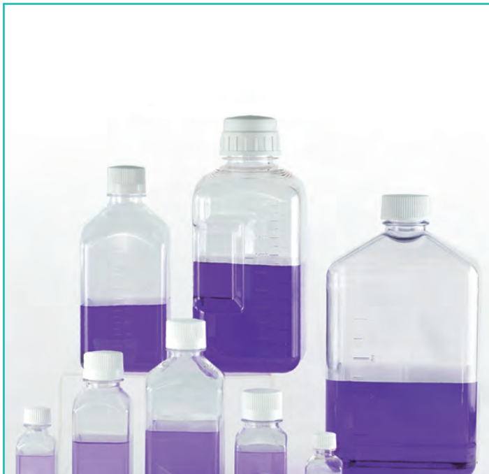
Square Storage Bottle