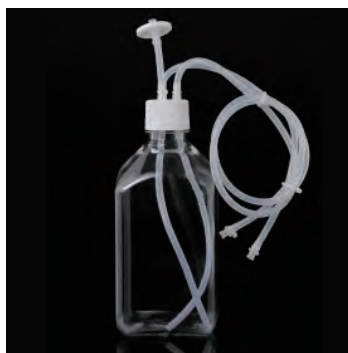
Closed System Solution(3-Port Transfer Cap)