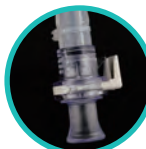
MPC Connector (male/female)