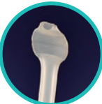
Heat Seal (no connector)