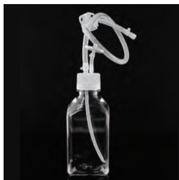
Closed System Solution(Bi-Directional Transfer Cap)