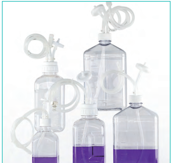
Square Storage Bottle Closed System Solution