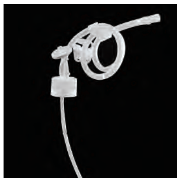
Bi-Directional Transfer Cap