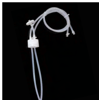
3-Port Transfer Cap