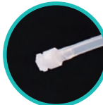
Luer Connector (male/female)