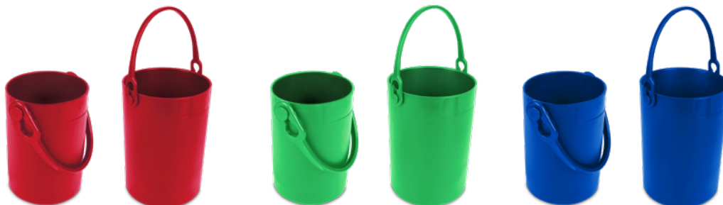
Available in 4 Colors for easy identification and organization