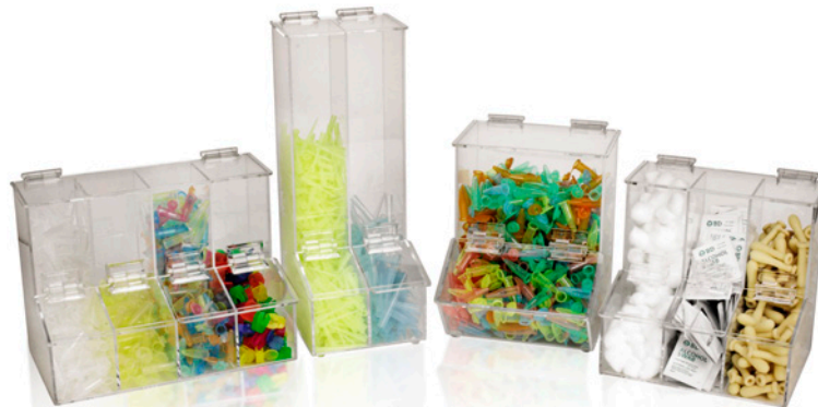
Workstation Dispensing Bins Clear, 4 Sizes Available