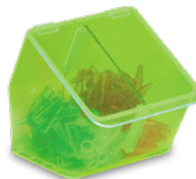
Benchtop Dispensing Bin 2 Compartment HS23411 Neon Green 7.1 x 6.1 x 6.5 in 18 x 15.5 x 16.5 cm