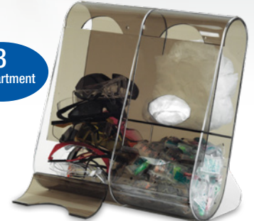
3-in-1 Dispenser HS1042 Grey 16 x 16 x 8 in 40.6 x 40.6 x 20.3 cm