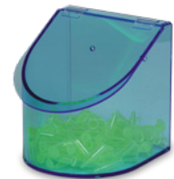
Benchtop Dispensing Bin Single Compartment HS23412 Neon Blue 6.1 x 6.1 x 6.7 in 15.5 x 15.5 x 17 cm