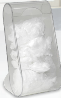
Soft Cover Dispenser HS1040C Clear 8.9 x 6.4 x 6.1 in 22.7 x 16.2 x 15.6 cm