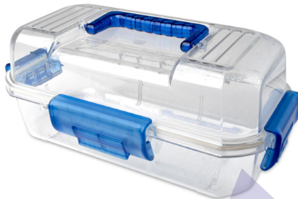
A Perfect Fit OneRack® Tube Rack Accommodates 13 mm, 16 mm and 20 mm tubes with our Half and Full Size OneRack®

Included separators can also be used to create inner compartments. Or, use without racks or separators as one large storage space for larger samples or supplies