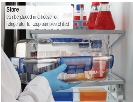
Store can be placed in a freezer or refrigerator to keep samples chilled